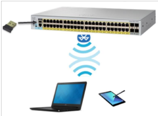
Figure 2. Over-the-air switch access using Bluetooth